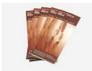
Tekno Retail Brochure