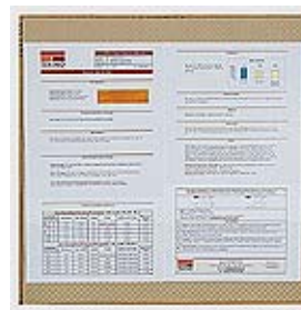
Tekno Display Panel - back