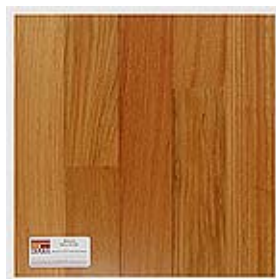
Tekno Display Panel - front