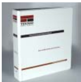
Tekno Reference Manual