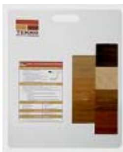
Tekno Story Board Panel