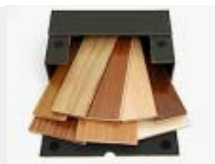
Tekno Black Box