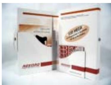
Architectural Folder w/CD ROM