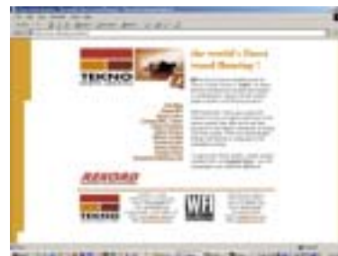
Tekno NA Web Site www.teknona.com