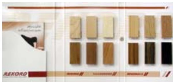
Architectural Folder w/CD ROM (inside view)