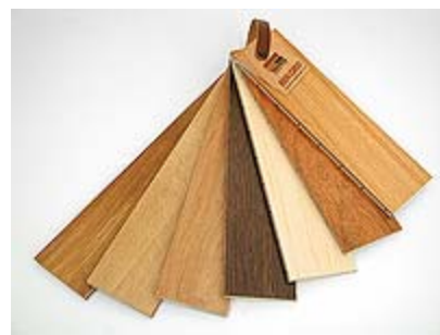
Tekno Fan Set