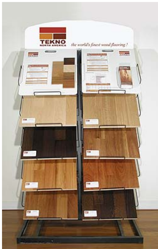
Tekno Point of Purchase (POP) Display Rack

WFI, in conjunction with Tekno, has developed an extensive range of marketing aids, sales tools and Point of Purchase Displays. WFI is pleased to offer the following: